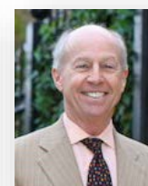
Imm. Past President